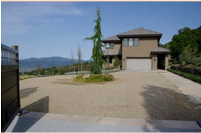
Fire hardening adds form and function.

http://www.napafirewise.org/DS%20Download/defensable-space-live/05_defensiblespace.html