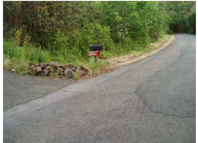
What is the address?