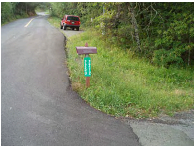
Good Address! Easy to find.

Go to www.mtveederfiresafe.org to find the order form near the bottom of the website and how to pay. Help the local Dry Creek-Lokoya Volunteer Fire Department firefighters and other emergency apparatus easily find your home when every second counts!