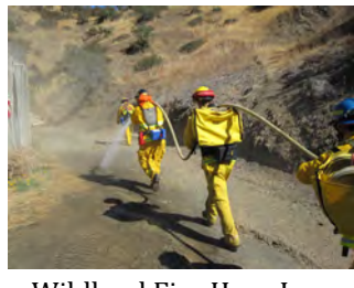
Wildland Fire Hose Lay