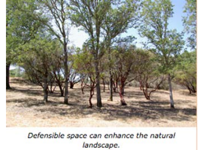
Defensible space can enhance the natural landscape.