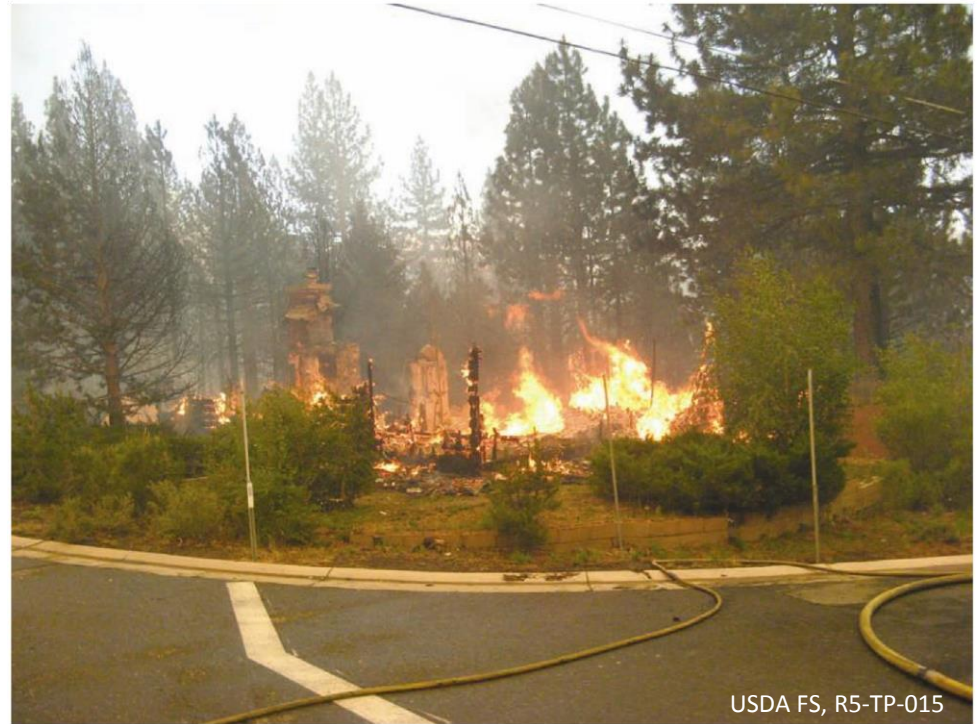
Angora Fire – South Lake Tahoe

Wind-blown embers are responsible for the majority of building ignitions